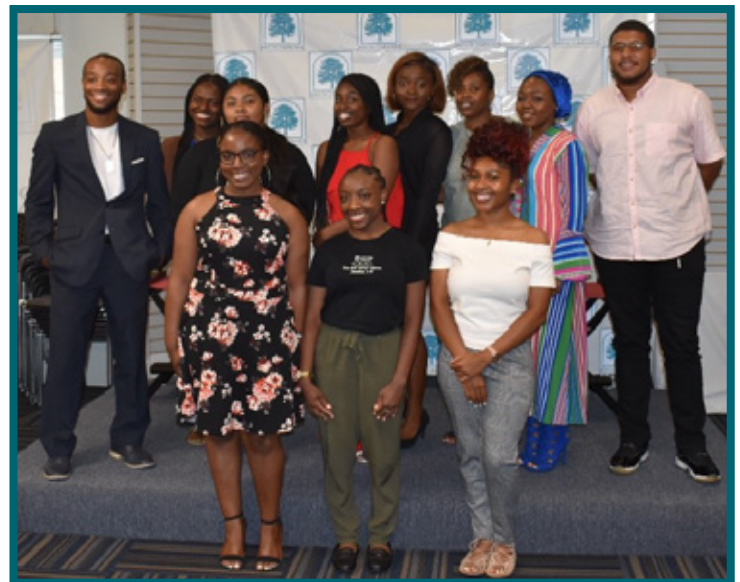
2019 Beech Scholarship Fund Recipients (several recipients not pictured)