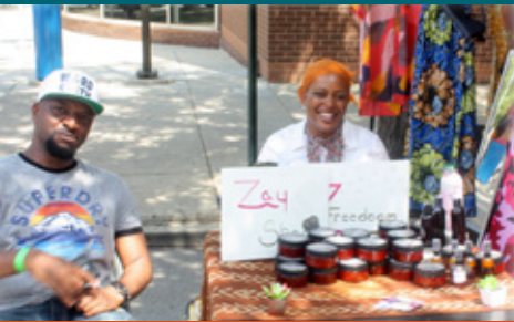
Beech Community Services